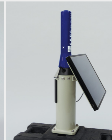
Autonomous Spectroscopic Monitoring Station