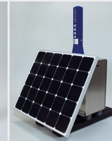
Autonomous Spectroscopic Monitoring Station for low solar insolation