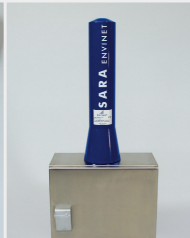
Spectroscopic Gamma Monitoring Station