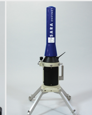
Mobile Spectroscopic Monitoring Station