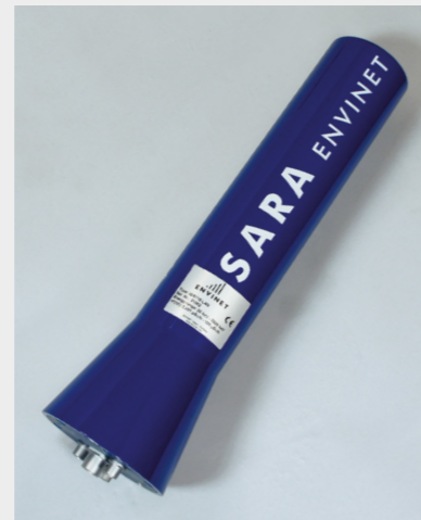
Spectroscopic Gamma Detector